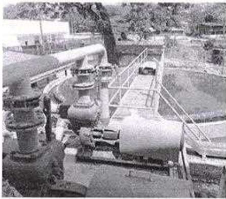
500 KLD STP at Kozhikode medical College