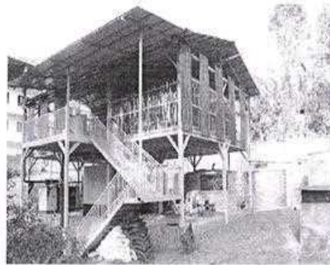
1 MLD STP at Kozhikode medical College