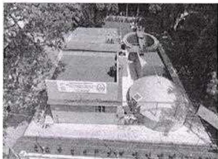
360 KLD STP at General Hospital, Thrissur